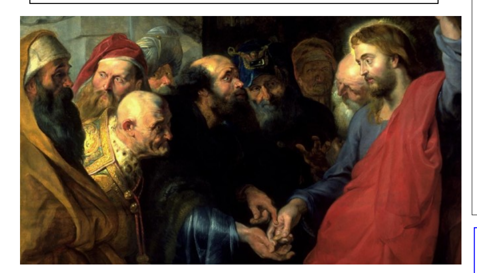
SACRAMENT REGISTRATION NIGHT

"Ascribe to the Lord glory and strength." - Responsorial Psalm