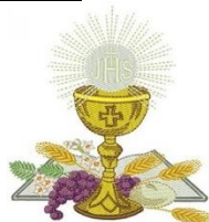
"My Jesus, give me the grace to receive You always - with a pure and contrite heart"

We are grateful for all those who have registered. Workbooks will be distributed Mass on the weekend of Jan. 16 th & 17 th . Parents will be contacted by email to arrange further details.