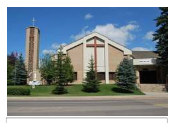
We are a welcoming community of believers guided by the light of the Holy Spirit to live Christ's love through the sharing of our gifts.