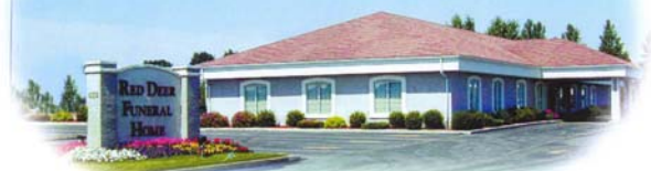
Red Deer Funeral Home and Crematorium

Best wishes on your preparations for your upcoming Centennial in 2006